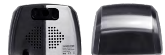
BRUSHED | BSD60K-BS