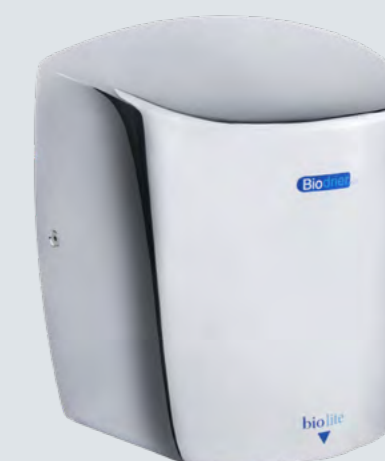
CHROME | BL09C