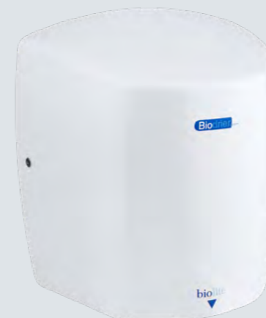
WHITE | BL09W