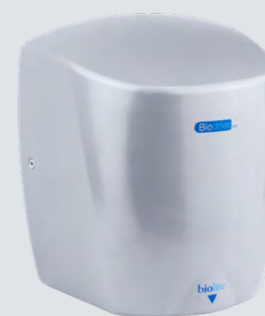
SILVER | BL09S