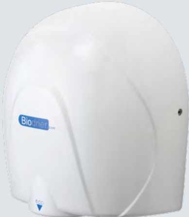
WHITE | BE08W