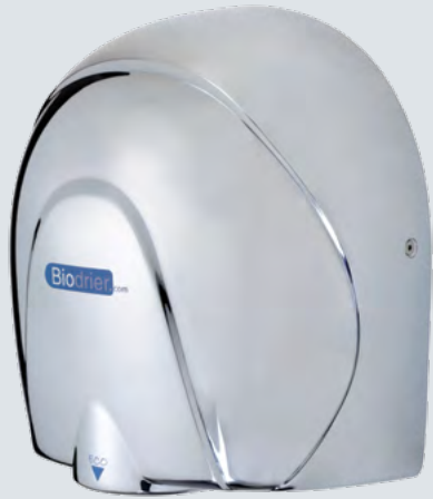
CHROME | BE08C