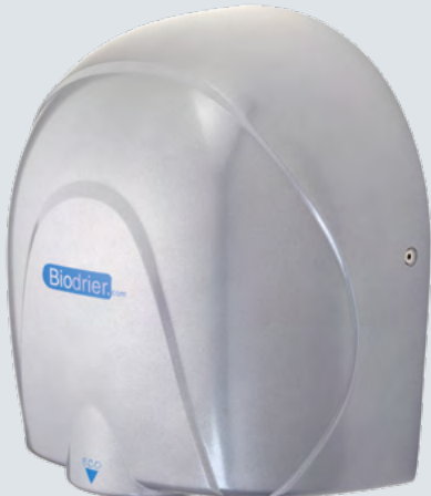
SILVER | BE08S